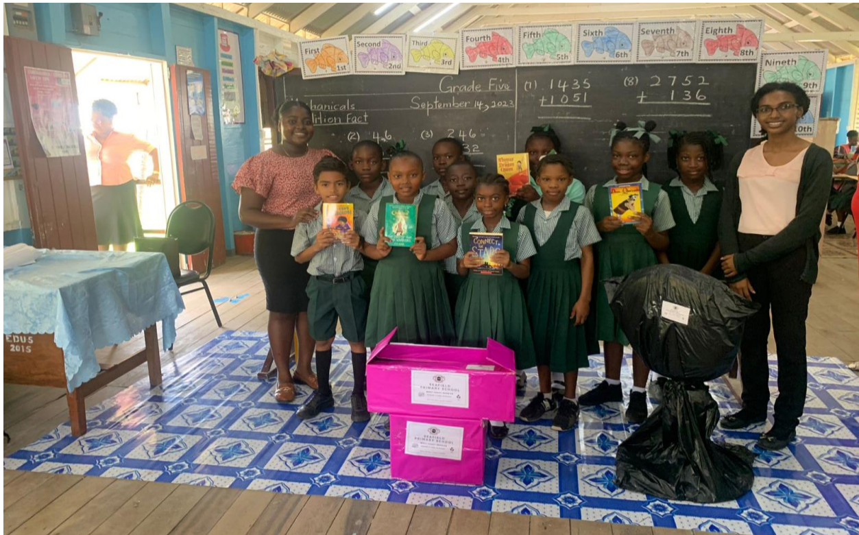
Evidence 1: Handing over the donations to Seafield Primary School